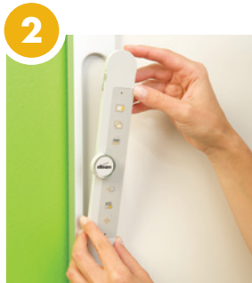
eBeam Digital Upgrade