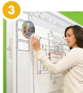
Fully featured boards allow interactive note capture, live annotations, remote meetings and more